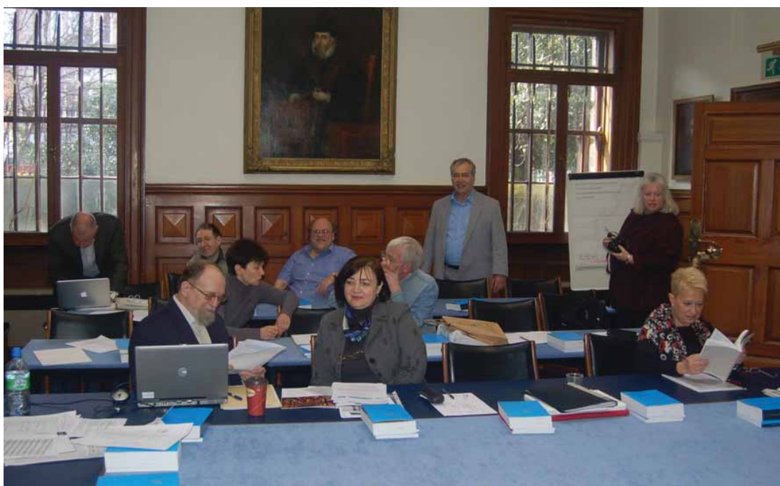
EAAS Board Meeting