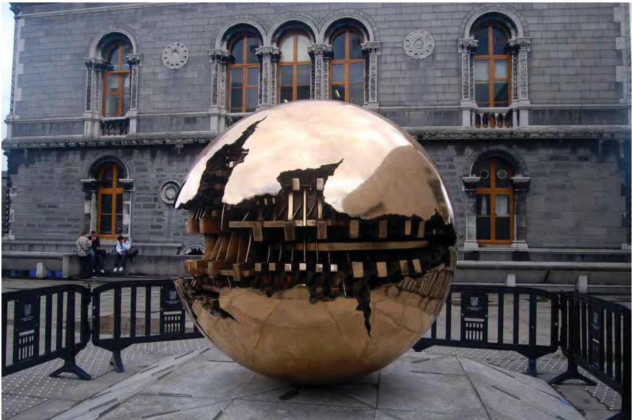
Sphere Within Sphere by Arnaldo Pomodoro, outside the Old Library of Trinity College, Dublin