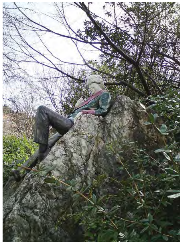
Statue of Oscar Wilde, Archbishop Ryan Park, Merrion Square, Dublin