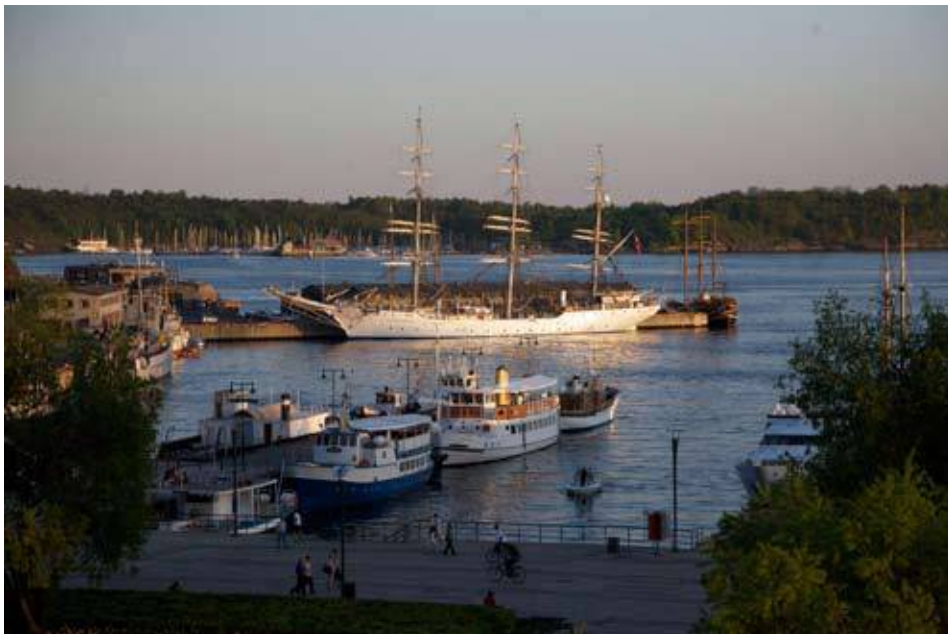
Oslo Harbor sunset