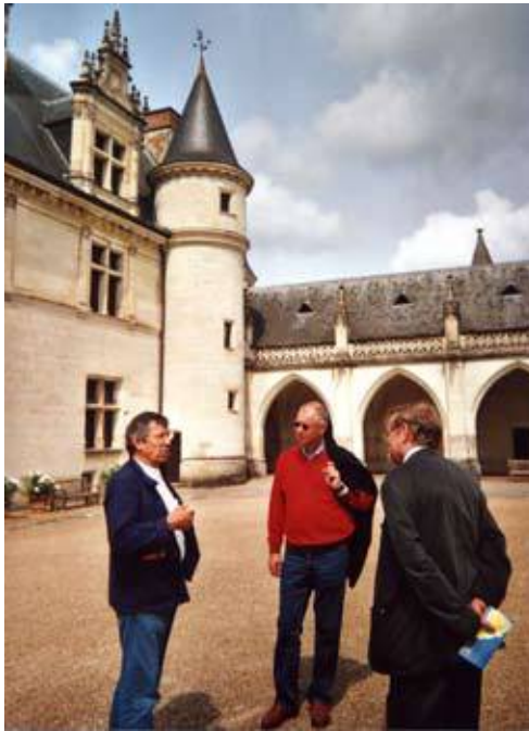
Handover Meeting in the Touraine

The most important recent EAAS enterprise has been the founding of the European Journal of Ameri-