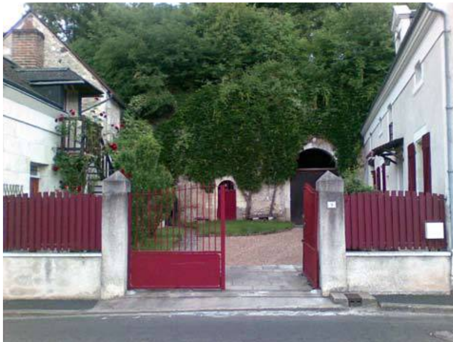
The Chénétier residence, 9 rue Basse, Chissay-en-Touraine