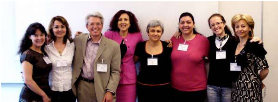
The participants of Workshop 12

topic standing at the intersection of race, gender and class, for it is closely related not only to skin color but also to matrilineage vs. patrilineage, ownership and private property. Because whiteness is an invention for the protection of a set of privileges, the papers demonstrated how passing for white has inevitably inspired racial and ethnic groups other than African-Americans and how it has served as a catalyst of 19th-century Southern racial politics in which European immigrants threatened the bipolarity of black and white. At the end of the discussions, passing emerged as a complex issue in which the paradoxes of American history are inscribed and which has intimate ties with hybridity and liminality. The workshop as a whole also demonstrated that the responses to passing have become increasingly positive in contemporary fiction and art where it is employed to reveal the fluidity of identity and unreliability of physical racial markers, mocking and exposing the constructedness and susceptibility of the whole concept of race.