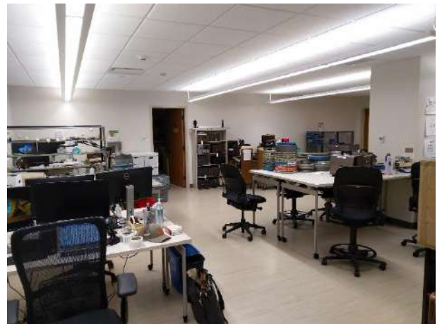
(3) The Moving Image Archive at the Herman B. Wells Library, Bloomington (Indiana).