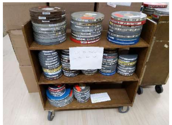
(4) Film canisters of social guidance films from the educational film collection of the Moving Image Archive.