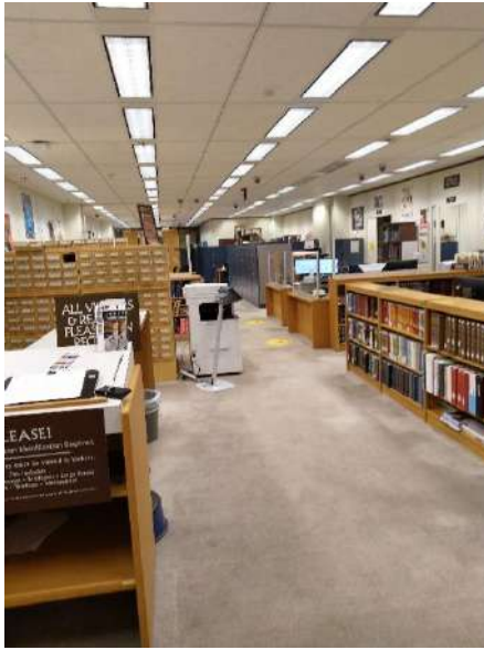
(1) The Moving Image Research Center in the James Madison Building of the Library of Congress (Washington D.C.).